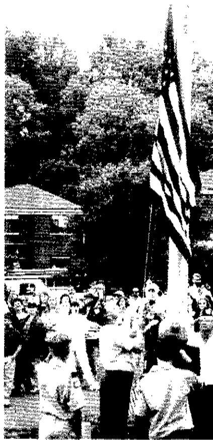
The flag-raising ceremony, following the parade, where the community members were honored.

Dixie Heights High School's marching band led the parade.